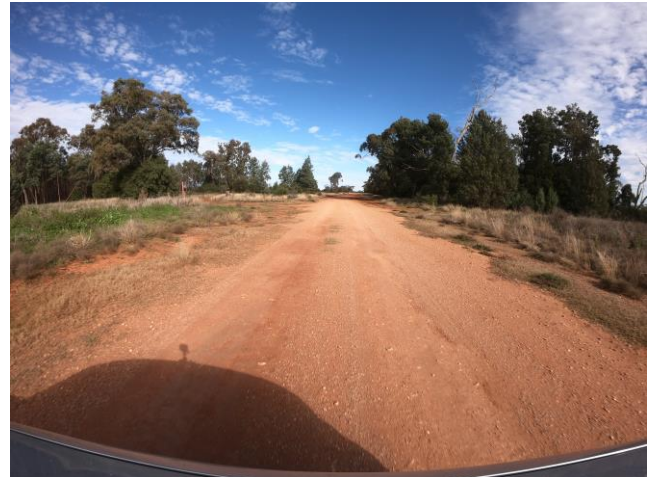
Crushed rock section