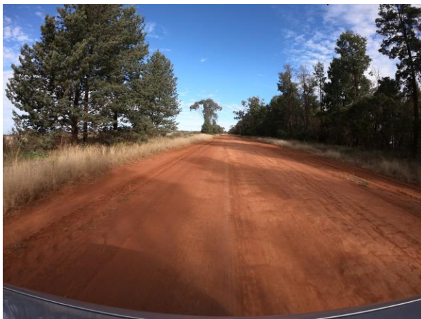
Formed only section