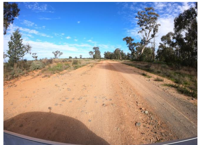
Crushed rock section WhitbarrowCk

The road is currently in a good condition but, like the majority of our roads, suffers from constant vehicle use in periods of wet weather. This is especially the case through winter when the pavement becomes wet and the colder weather prevents wet pavements from drying out.