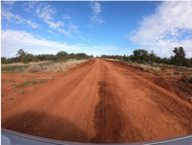
Formed only section

The road was inspected on the 13 th July 2021 after the first section of the road had been maintenance graded. The following photos show the current condition of the road.