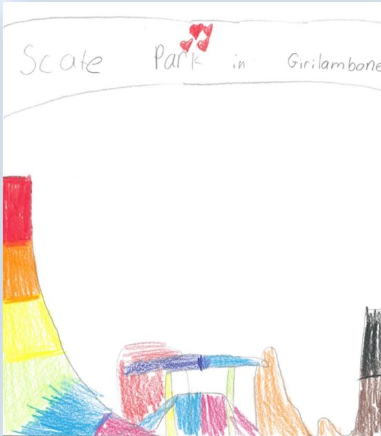
Georgia Girilambone Public School