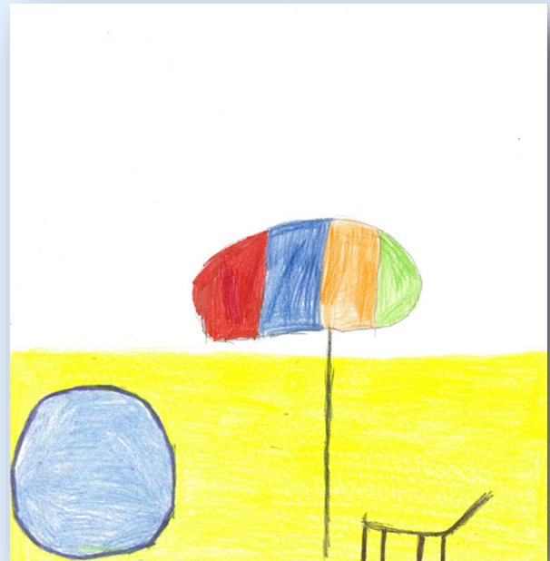
Ella Girilambone Public School