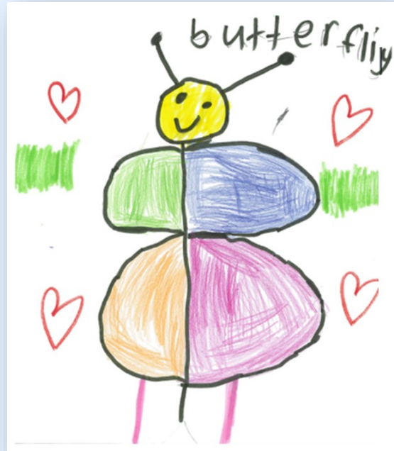
Addison Nyngan Public School