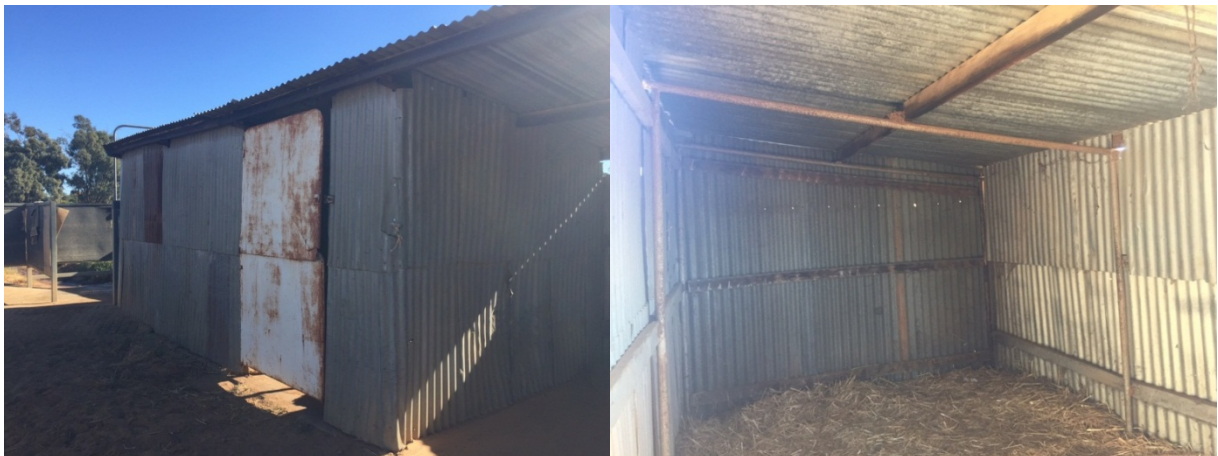
Existing Swabbing Shed

The Secretary advised that the Steward requested the existing swabbing shed be enlarged to twice the depth and the roof height be increased. This work cannot be carried out on the existing structure and will require demolishing the existing shed, extending the concrete slab, and building a new shed.