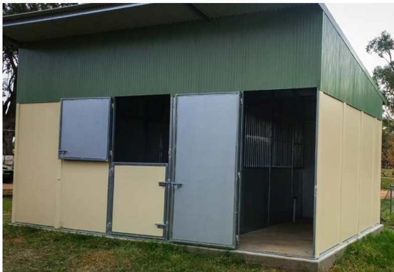
Example of a pre-fabricated swabbing shed

If Council decided to approve funds for the new shed, we would need to confirm the design and standards with the Nyngan Jockey Club and Racing NSW as the estimated cost is between $14,000 and $24,000 depending the required finished product.