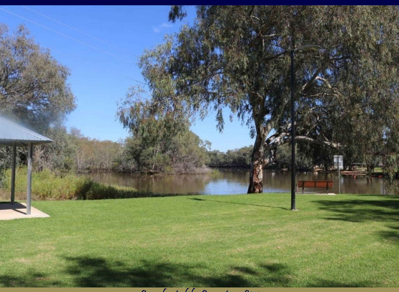
Comfortable Country Living