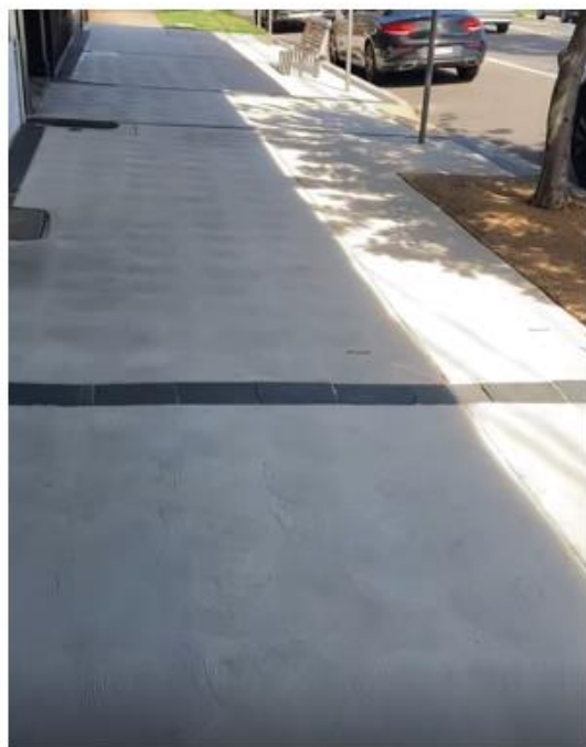
Row of Pavers across Path