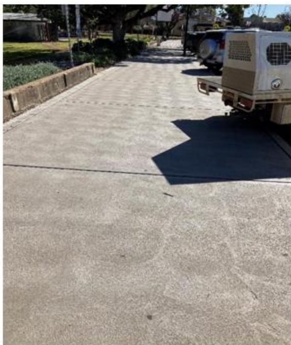
Coved Trowel Finish

It is recommended that a row of darker grey pavers are installed across the path at regular intervals to break up the large areas of a single colour, similar to the path shown below.