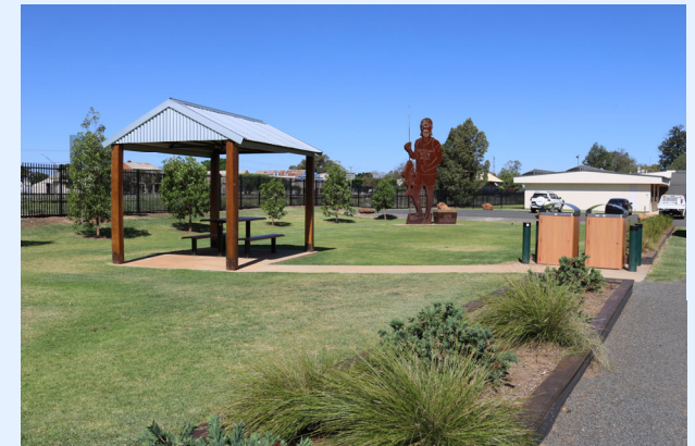
Teamster's rest park presided over by the Big Bogan.

Rotary Park, Jack Hargreaves Park and the lower weir. Extensive upgrades have been done to this riverside area including the removal of weed vegetation, and the construction of cement and gravel pathways connecting Rotary Park to the Nyngan main street. Bollards and solar lighting have been placed around the pathways, picnic shelters and steps have been built, and turf laid on parkland adjacent to the end of Cobar Street, to be named Jack Hargreaves Park. Jack is our Toyko 2020 Olympics Gold Medallist rower in the men's coxless four. A fountain has been installed in the river in this area. New playground equipment, a shade shelter and accessible BBQ were installed at Rotary Park.