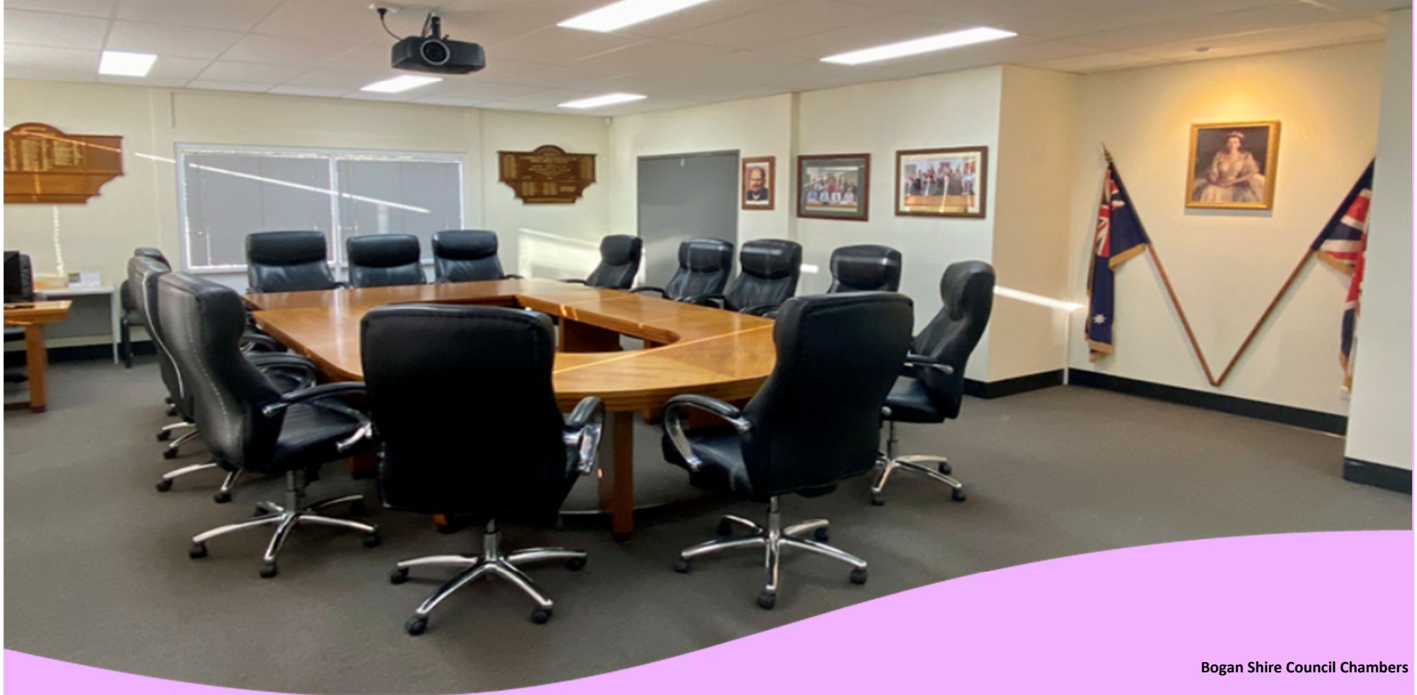
Bogan Shire Council Chambers

Goal - Strong, transparent and effective governance with an actively engaged community to ensure we remain Fit For The Future.