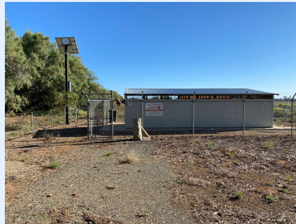
Nyngan's animal pound.

Safe Food Standards: Council undertakes annual inspections of food premises to ensure food handlers comply with standards.