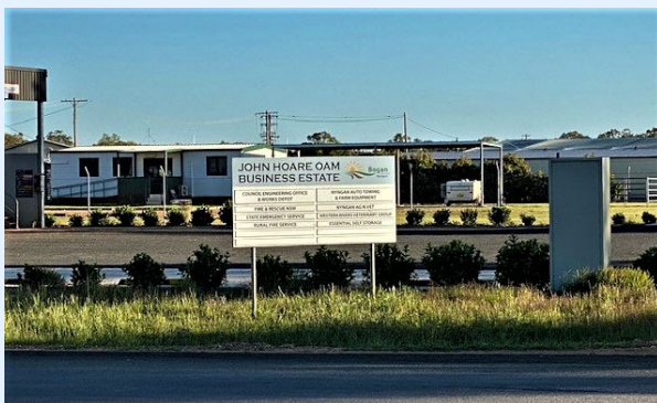
Council established the John Hoare OAM Business Estate

Council has continued to make available land for industrial businesses, with almost all available lots in the John Hoare OAM Business Park now taken. New businesses have included a car wash and laundromat; bulk fuel supplier; agricultural retailer, and storage facility.