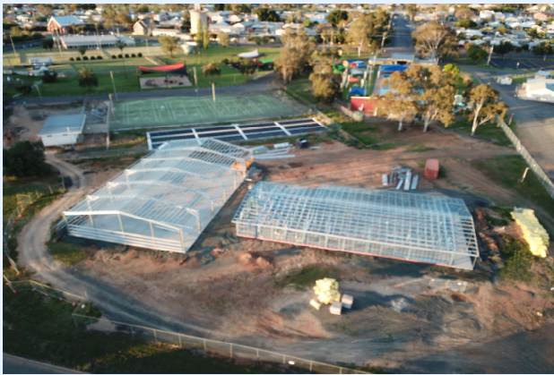
Bogan Shire Youth & Community Centre under construction

Youth and Community Centre: The CSP identified a need for a community youth centre. After extensive liaison with the community Bogan Shire Council applied for grant funding to build the Bogan Shire Youth and Community Centre. Construction is due to be completed early in 2022 and Council has funding to employ a dedicated youth officer. The airconditioned centre will include a full-size indoor sports hall, community meeting rooms, a recreation, room, study areas, gaming room, kitchen, and an outdoor recreational area and play equipment.