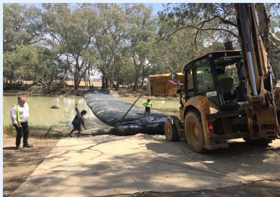
A temporary weir being installed on the Bogan River during the drought

Council carted water to the villages throughout 2019 when their storages dried up. Drinking water was also made available to rural residents whose household supplies were dry.