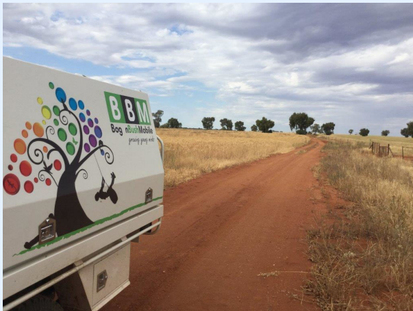
Bogan Bush Mobile vehicle in a rural setting

Bogan Bush Mobile: Bogan Bush Mobile transferred its headquarters to the new ELC when the centre was opened in 2016. This service has undergone significant changes to bring it into scope. Where previously the service travelled to small centres across the region to provide two hourly playgroup sessions, it now offers child care sessions in those areas.