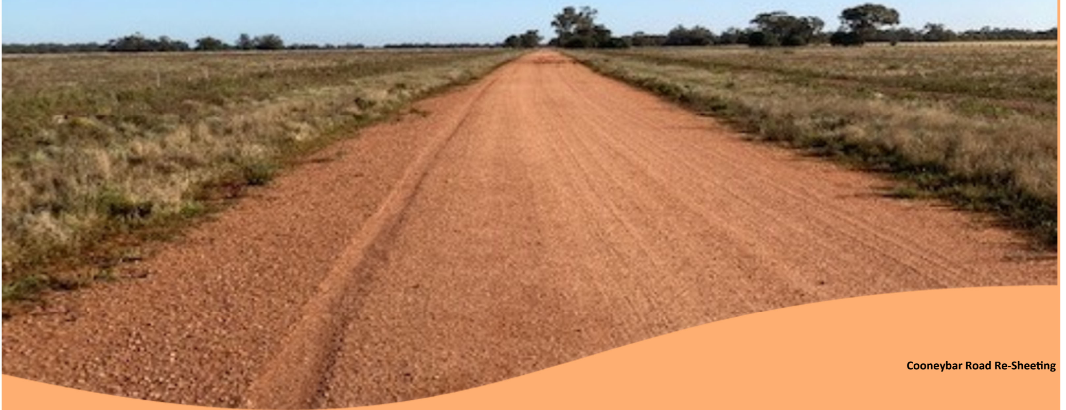
Cooneybar Road Re-Sheeting

Goal - construct and manage reliable and efficient community assets that provide access to quality services.