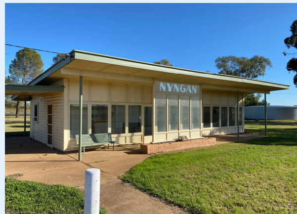
Nyngan's airport building

Nyngan Airport. Council has continued to upgrade airport facilities to meet the required standards. Council has resealed the main runway and apron, re-fenced the airport and in 2021 installed refuelling facilities.