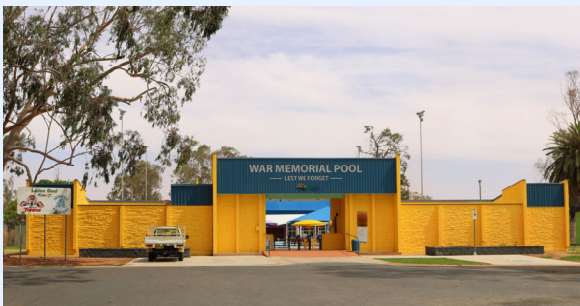
The façade of the Nyngan Pool got a facelift in 2019

Outcome: Our community uses and values the educational, recreational and social opportunities provided by our community centres.