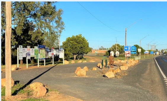
Information Bay at the approach to Nyngan

Town Approaches. Council has continued to investigate options for beautification along the main roads into town. On advice from NSW Roads and Maritime Services Council removed unauthorised signage on the highway verges and built designated roadside information bays on the east and west approaches to Nyngan for local businesses to advertise. Smaller versions of the Big Bogan were also commissioned and installed here.