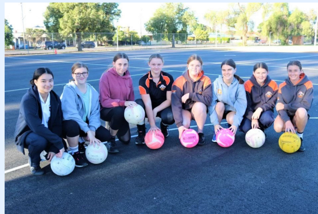
The Larkin Oval netball courts were surfaced in 2020

Larkin Oval: Larkin Oval has undergone extensive renovations and updates. These include new lighting towers, new fixed grandstands, a new canteen and announcer's box, a changeroom and shower block, and an electronic scoreboard. There is also lighting over the netball courts and two now have permanent hard surface.