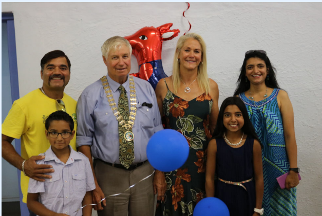
We often celebrate citizenship ceremonies on Australia Day.

In 2020 when the NSW Government placed restrictions on events due to the COVID-19 pandemic, Council held an Australia Day event outdoors at Larkin Oval, using grant funding to purchase six new shade shelters