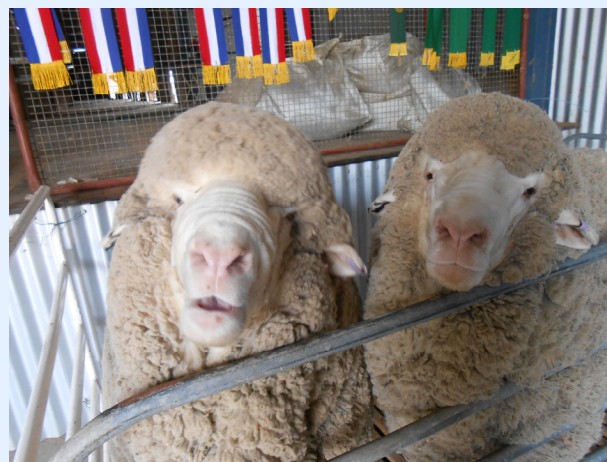
A pair of Bogan Shire's prize-winning rams.

Council has continued its policy of shopping locally where possible and in the best interests of council.