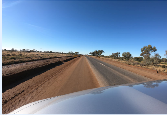
Mitchell Highway construction on behalf of the RMS

bitumen seal on the seal on Cockies road, Pangee Road, and Colane Road.