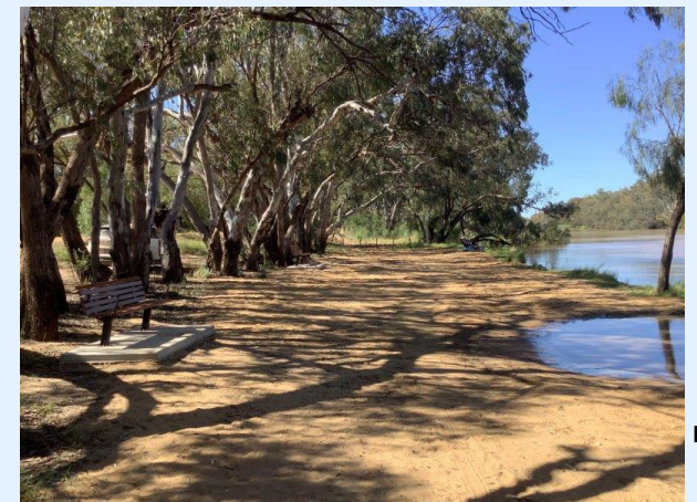
The Shire's natural environment is preserved and protected—Nyngan Upper Weir recreational area

Provision of safe, high-quality playgrounds and parks.