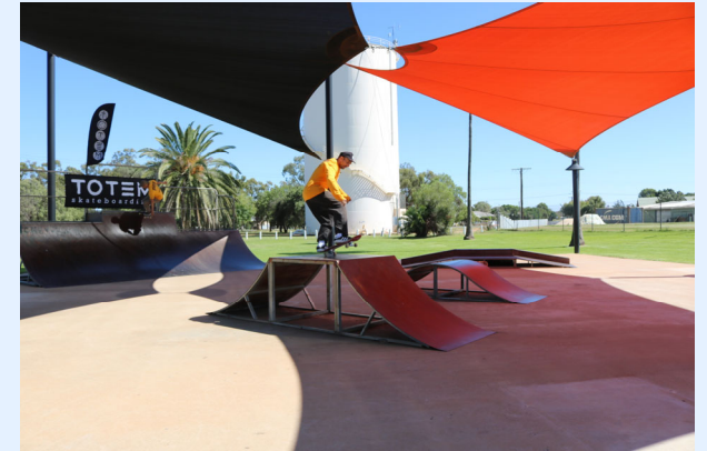
Totem skateboarding workshop during Youth Week.

Bogan Shire Seniors Week: Council co-ordinates five days of community Seniors Week activities including the official morning tea and presentation of the Senior Citizen of the Year at the Nyngan Town Hall. Other activities have included concerts, lawn bowls, bingo, guided tours to the solar farm and Callubri Station, free entry to the Nyngan Museum, Community cooking, health checks and exercise sessions.