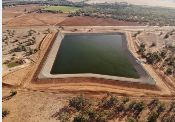
Nyngan's new emergency water storage

in 2019 drought made this route unviable. This prevented the mine from having to close due to water shortage.