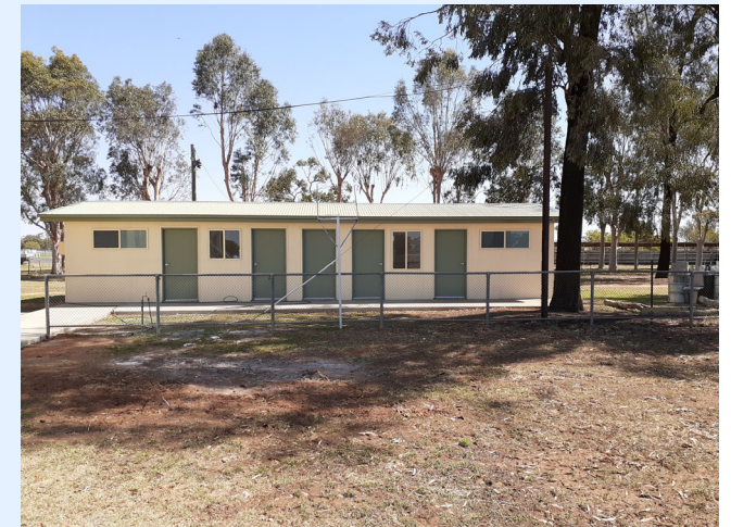
New Jockey Rooms—Nyngan racecourse

Nyngan Showgrounds. Council has made significant improvements to the Nyngan Showground and Racecourse for the purpose of community events. This includes new perimeter fencing; a new building for jockeys, stewards and the secretary at race days; shelters for gatekeepers at the three entrances along Hoskins street; painting and improvements to the Walker Pavilion; new flooring and display boards in the Wye Pavilion; the new Rodney Robb arena for the Nyngan Pony Club and Nyngan Show Society; and resealed the internal roads.