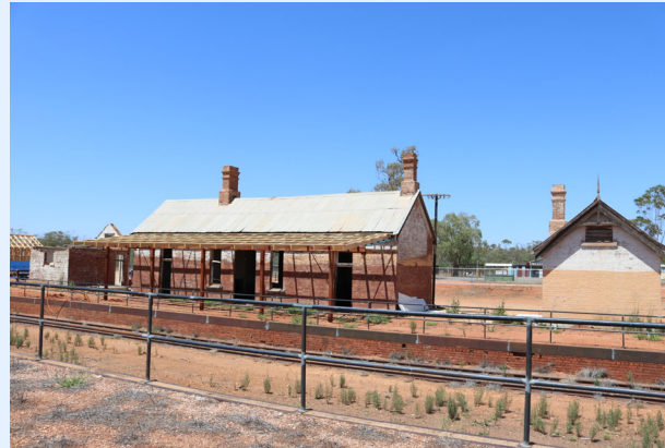
Girilambone Railway Station under restoration in 2020.

Girilambone Railway Station buildings to use as a tourism asset. There will be free camping, facilities for catering, a small museum. The project will provide capacity for the Girilambone community.