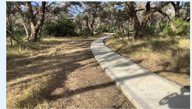
An inviting trail linking the Early Learning Centre with Frank Smith Oval

Hermidale Sports Ground: Council has utilised grant funding to build a new disabled toilet block and shower at Hermidale Sports Ground. It has also installed a defibrillator in the Gun Club Clubhouse, and eight new horse stalls.