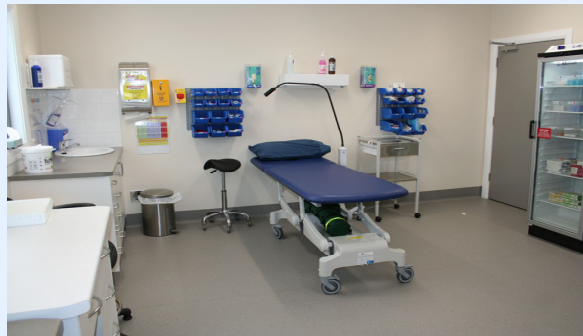
The fully-fitted Treatment Room at the Bogan Shire Medical Centre

A pathology service operates from the centre five mornings a week.