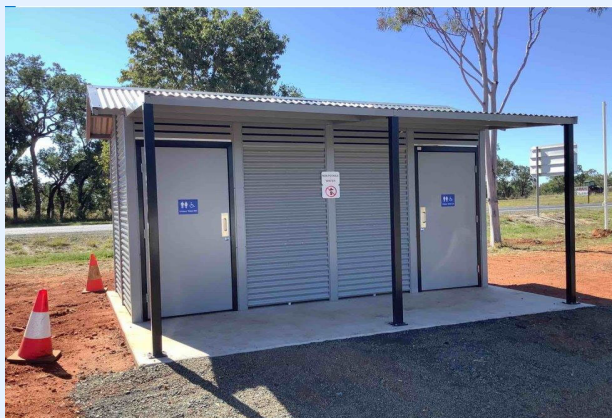
Prefabricated toilet block installed at Coolabah bus stop

Coolabah Bus Stop: A new public toilet block has been installed to service passing traffic in response to community need.