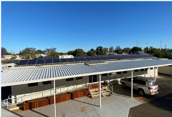
Solar panels on the Council Chambers roof.

Solar panels on Council buildings: Council resolved in 2017 to utilise the roof spaces of its civic buildings for solar panels. This was to reduce utility costs for Council and therefore ratepayers, and also to switch to a cleaner form of energy.