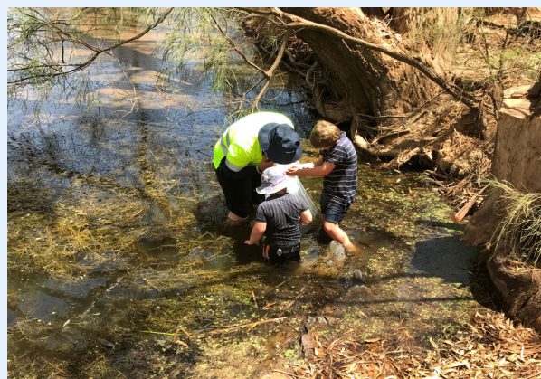
Bogan Shire Council carries out an annual native fish stocking program in the Bogan River

Council continues to be an active member of NetWaste, the regional waste management group of 26 western councils, including supporting innovative recycling ventures such as the annual Waste to Art competition, as well as participating in regional contracts for the collection, processing and recycling or reuse of scrap metals, mattresses, tyres, greenwaste, concrete and masonry, drumMuster and the collection and safe disposal of hazardous household chemical