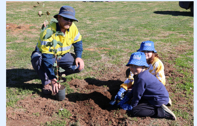
Tree planning with local school children

Council has worked with volunteer groups to support their activities by providing venues, administrative assistance with writing grant applications. This includes recognition of National Volunteer week.