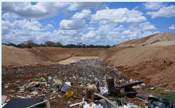
New landfill cells have been constructed at the Facility

In 2021 Council applied for grant funding to fund further works and improvements at the Nyngan Waste and Resource Management Facility including to: