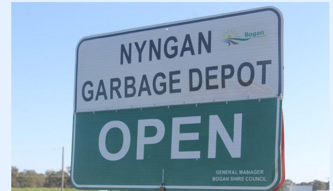
Nyngan Waste Management and Resource Recovery Facility has been progressively upgraded and brought to standard.

Flood Management Plan: Council has developed and implemented flood management plans into the LEP and DCP for all urban flood areas. Council continues to