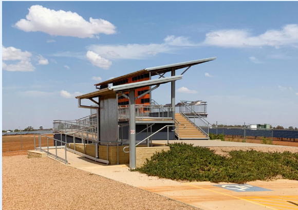
Nyngan Solar Farm viewing platform

Council lobbied AGL to build a viewing platform at its solar farm near Nyngan and also negotiated with local landholders to allow access to the site for visitors.