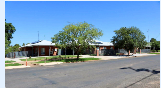
Bogan Shire Seniors Living units are managed by Bogan Shire Council

Bogan Shire Seniors Living. In 2020 Council completed and opened the Bogan Shire Seniors Living Project. This project used NSW Government grant funding to build four accessible units on the corner of Dandaloo and Cobar streets, formerly the site of the Nyngan Preschool and Bogan Bush Mobile. There are three two bedroom units and one single bedroom unit. Community members eligible to receive the Australian Age Pension, and who had resided in the Bogan Shire for 10 years or more were eligible to apply for residency. The units are currently full.