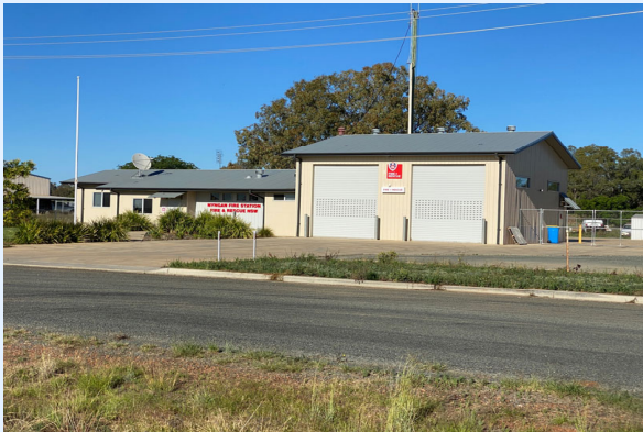
The new Fire and Rescue NSW building in Nyngan

Ambulance Service: Council continues to advocate for provision of a 24 hour Ambulance Service for the Shire.