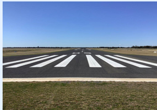
The runway and apron at the Nyngan Airport was resealed

Contract works on the state highways included continued rehabilitation work on sections of the Mitchell Highway East and West of Nyngan.