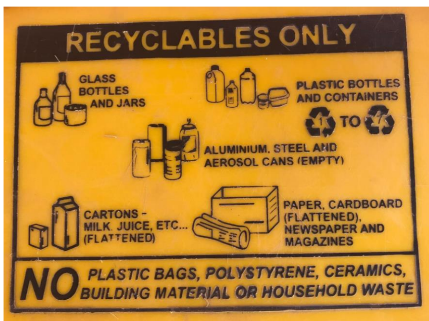
Picture 1. Existing signage on recycling bins.

Residential recycling bins currently display clear signage on what can be recycled as shown in picture 1 below. All residential recycling bins have this sign located on the lid of the bin. The current sign is clear and concise displaying both words and pictures.