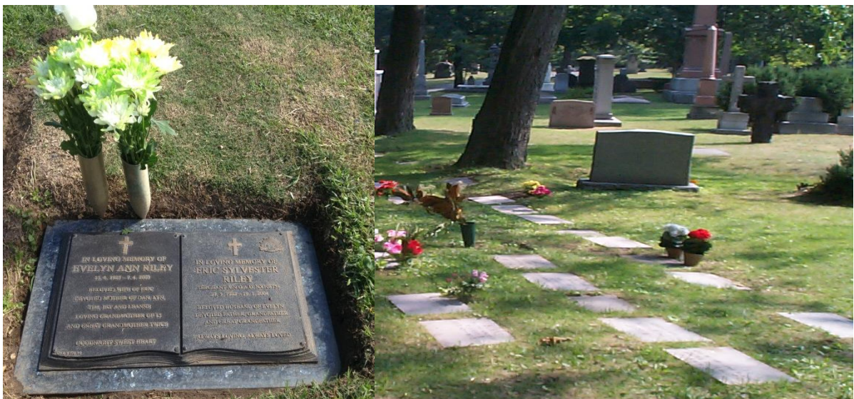
Type 2 Headstone