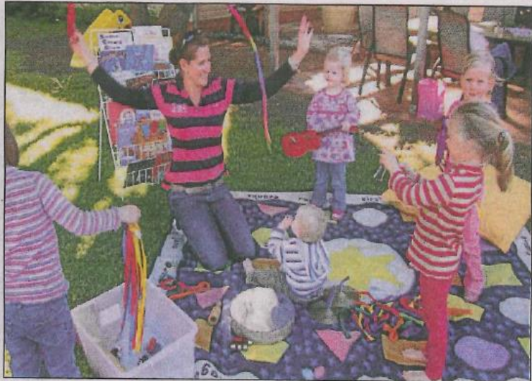
Children play at the Bogan Bush Mobile playground, Nyngan.

Mobile to upgrade its current two-seater vehicle to a larger one, allowing it to take healthcare specialists along on the fortnightly rounds to 13 western communities.