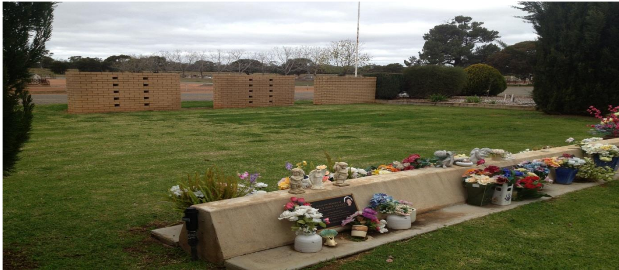
Type 1 Headstone